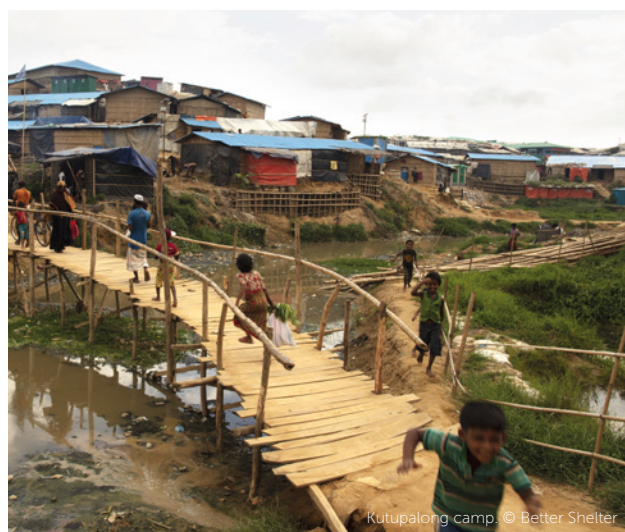
Kutupalong camp.

Training and final installation in the refugee camps in Ukhiya, Cox’s Bazar by Better Shelter was completed in five days.