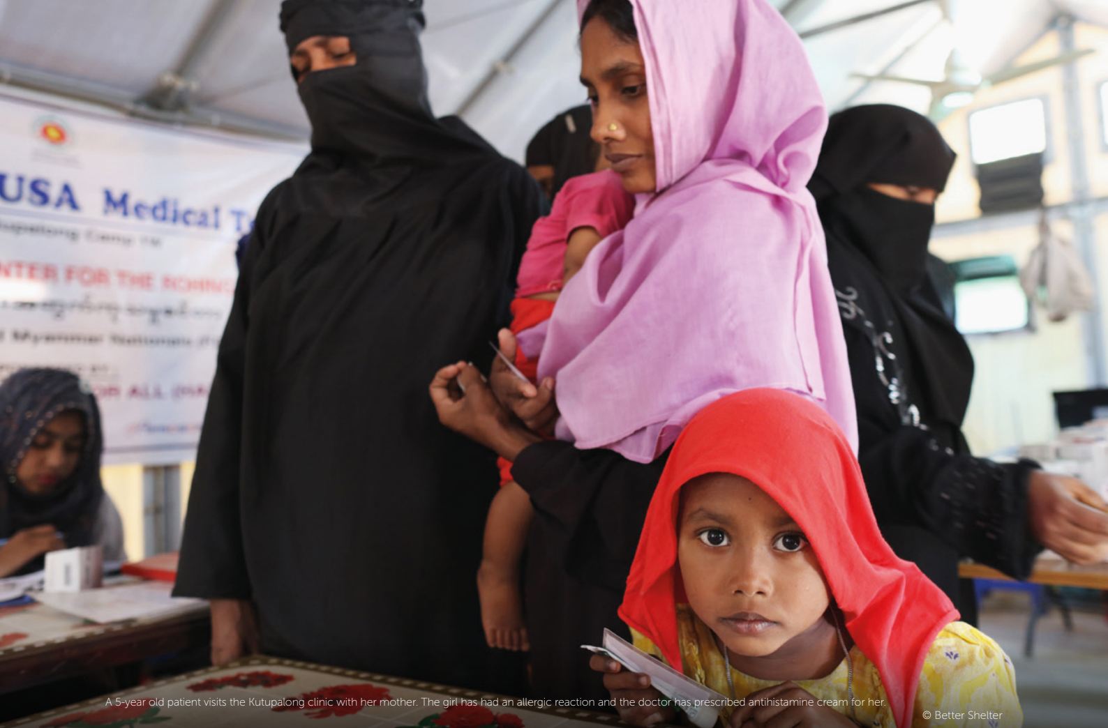
A 5-year old patient visits the Kutupalong clinic with her mother. The girl has had an allergic reaction and the doctor has prescribed antihistamine cream for her.